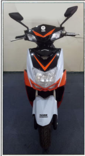
Front View of Test Vehicle