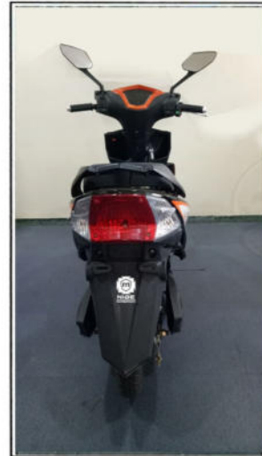
Rear View of Test Vehicle